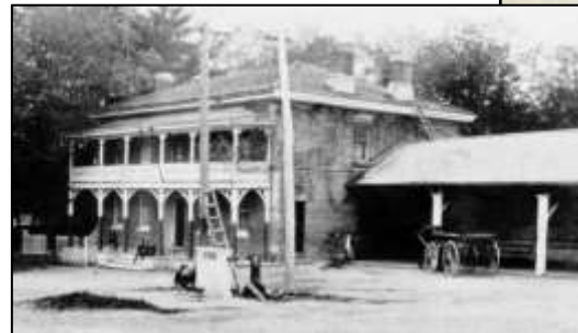
Picture material courtesy of Toronto Public Library, Heritage York and Project Gutenberg.